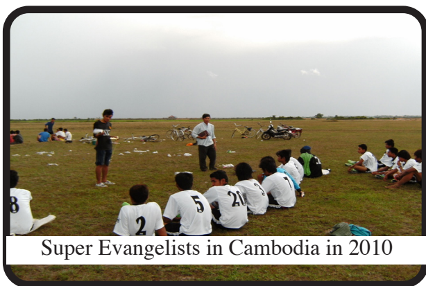
Super Evangelists in Cambodia in 2010

Christ Centered Missions has supported global missions for decades. In 2010, we gave a challenge to what we call Super Evangelists working in Cambodia to be creative in attracting people to hear the Gospel. One group purchased a soccer ball from a local market and went to an empty field and began kicking it around. Before long, the small crowd of 10 turned to 50 and continued to grow. The Super Evangelists presented the Gospel and new believers were added to His Kingdom. Not knowing exactly what God had planned, they recontacted our headquarters for help. We gathered up as many missionaries as we could find from different countries and invited them to share ideas at our headquarters in Atlanta Texas and Christ Centered Champions™ was born. It was there that CCC™ was born.