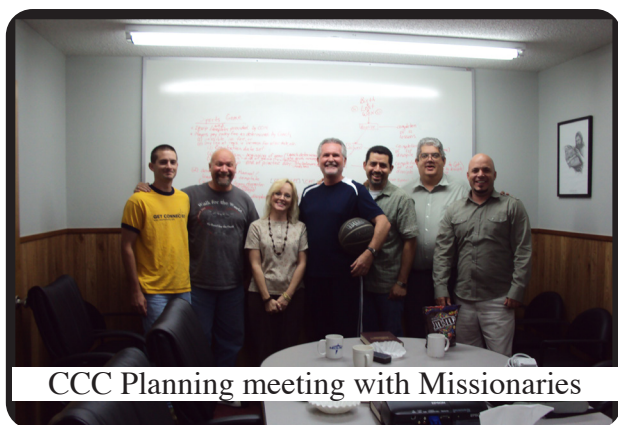
CCC Planning meeting with Missionaries